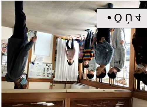
3-8 4 00 .