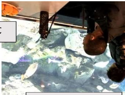
2 4201 1E